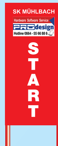
Start and Finish Vertical Banners