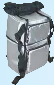
Cold protection Coat Trainer Radio Chest Pack Course Setter's Rucksack Trainer's Rucksack